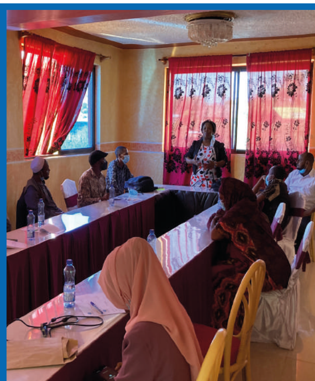
Isiolo, Kenya: A LPN that the SCN helped establish meets to reflect on the past month of delivery and to plan the next month of activities.

An LPN should have a clear and consistent Terms of Reference (ToR), or similar document, that outlines its mandate, structure, members' roles and responsibilities, modes for internal and external communication and decision-making processes. This will allow members to set up a clear internal modus operandi and ensure efficient, effective and transparent functioning of the team. Moreover, members should clarify where the LPN fits within the broader national and local prevention infrastructure to ensure other stakeholders are familiar with its remit and determine potential areas for collaboration. This facilitates the development of productive working relationships with institutions and civil society partners and avoids confusion as to the LPN's purpose.