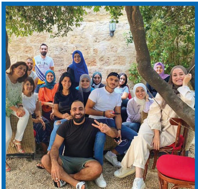
Tripoli, Lebanon: the SCN-supported LPN trains local youth on media literacy, including how to critically assess information consumed online and how to navigate the digital world safely.

The LPN's knowledge of the local context coupled with its proximity to members of the community, including the historically marginalised and excluded, allows them provide safe spaces and agency to citizens that otherwise may not feel that their voices are heard. LPNs can also prioritise outreach to specific constituencies, such as youth, and drive forward conversations around sensitive topics, such as destigmatising mental health and access to psycho-social support in locations that have historically been less understanding of them.