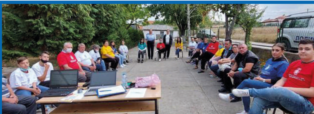
Kumanovo, North Macedonia: The SCN-supported LPN (known locally as the ‘Community Action Team’) holds a series of consultations with different neighbourhoods in Kumanovo to better understand residents’ perspectives of local threats and the infrastructure that can be leveraged to respond.

Depending on the capacities and expertise of their members, LPNs can directly implement and/or support and coordinate local initiatives and services. Direct delivery can range from the implementation of training, awareness raising or other capacity-building initiatives, to the provision of psycho-social support and trauma healing to those who would otherwise not seek these services from established institutions or pre-existing service providers, to supporting peaceful and credible elections. Equally important, the LPN can serve as a coordination mechanism for tailored interventions, referring individuals to service providers either within or outside of the network, should they require support that the LPN is unable to provide. Finally, LPNs can play an important role in involving local government and non-governmental stakeholders, including researchers, youth, religious officials and private sector representatives in the delivery of local action that strengthens community resilience and social cohesion.